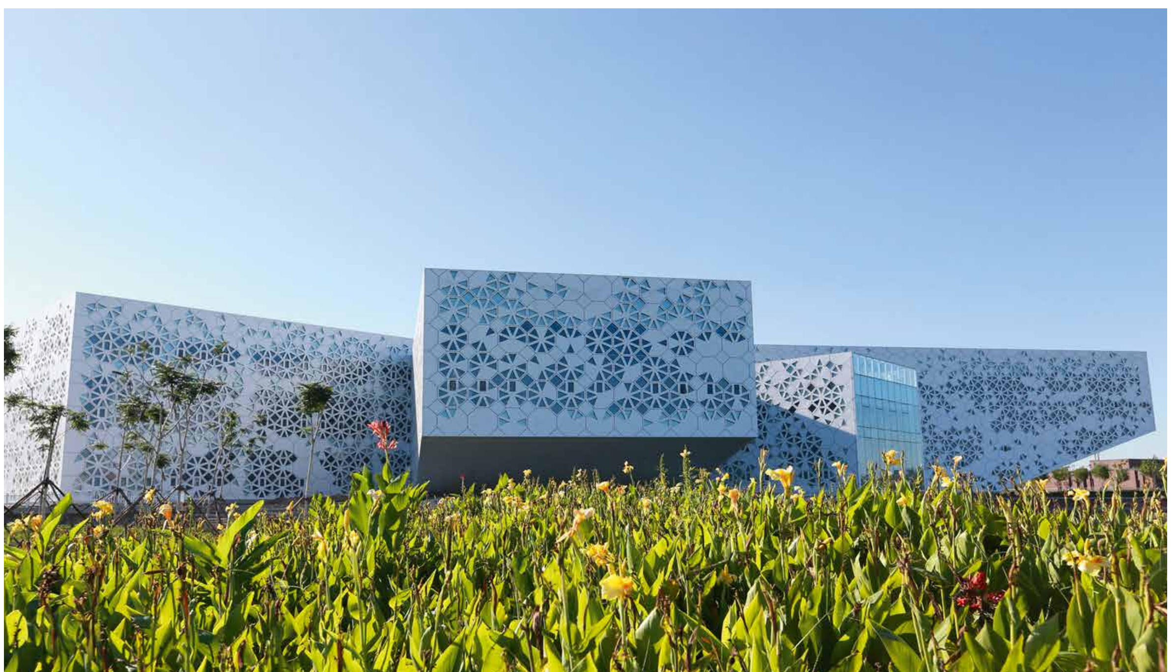
The student activity and sports centre.

Career opportunities include positions in higher education, government/foreign ministry, intergovernmental organisations, non-governmental organisations, think tanks; and further study at PhD level.