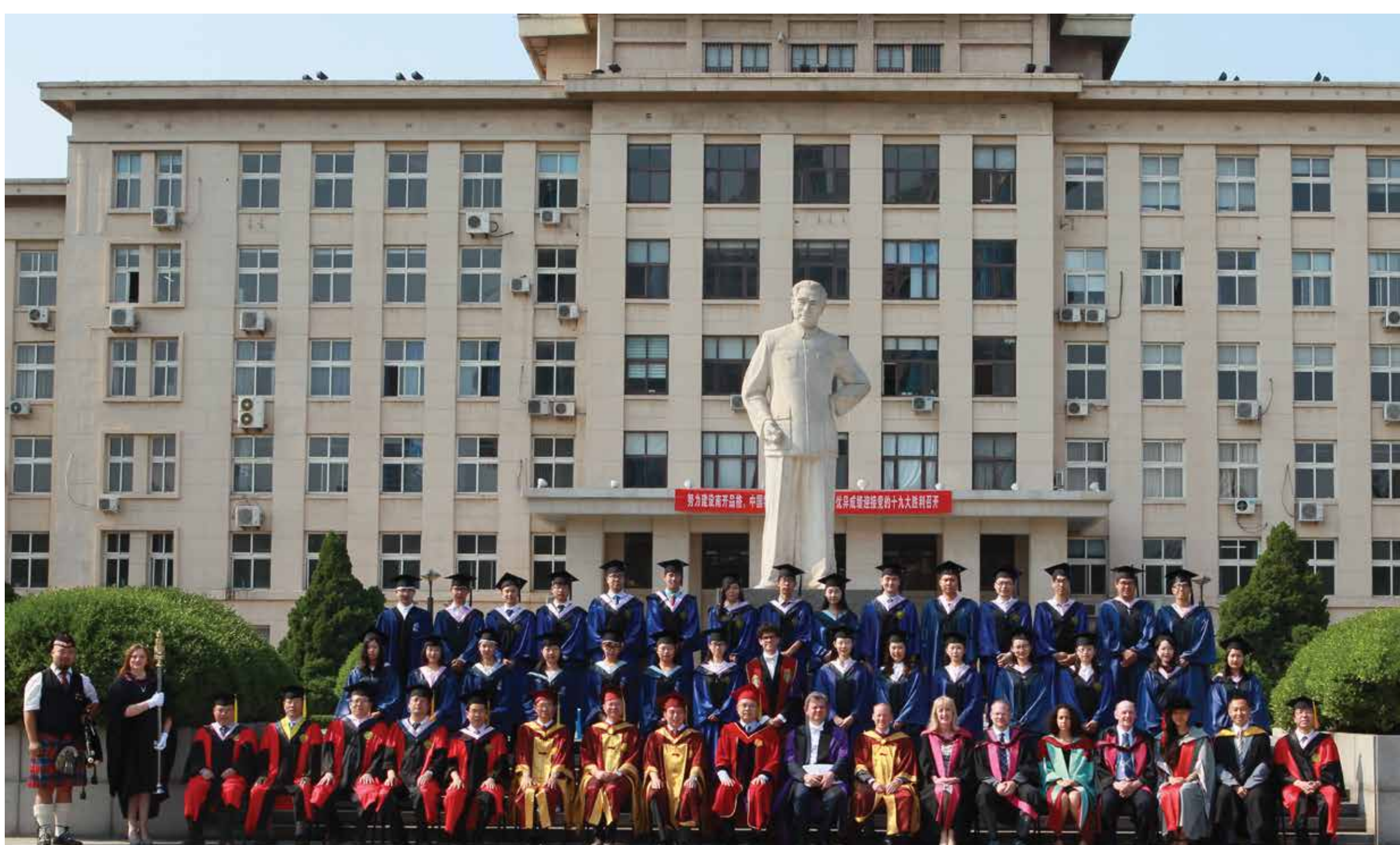
The first graduation ceremony in 2017.