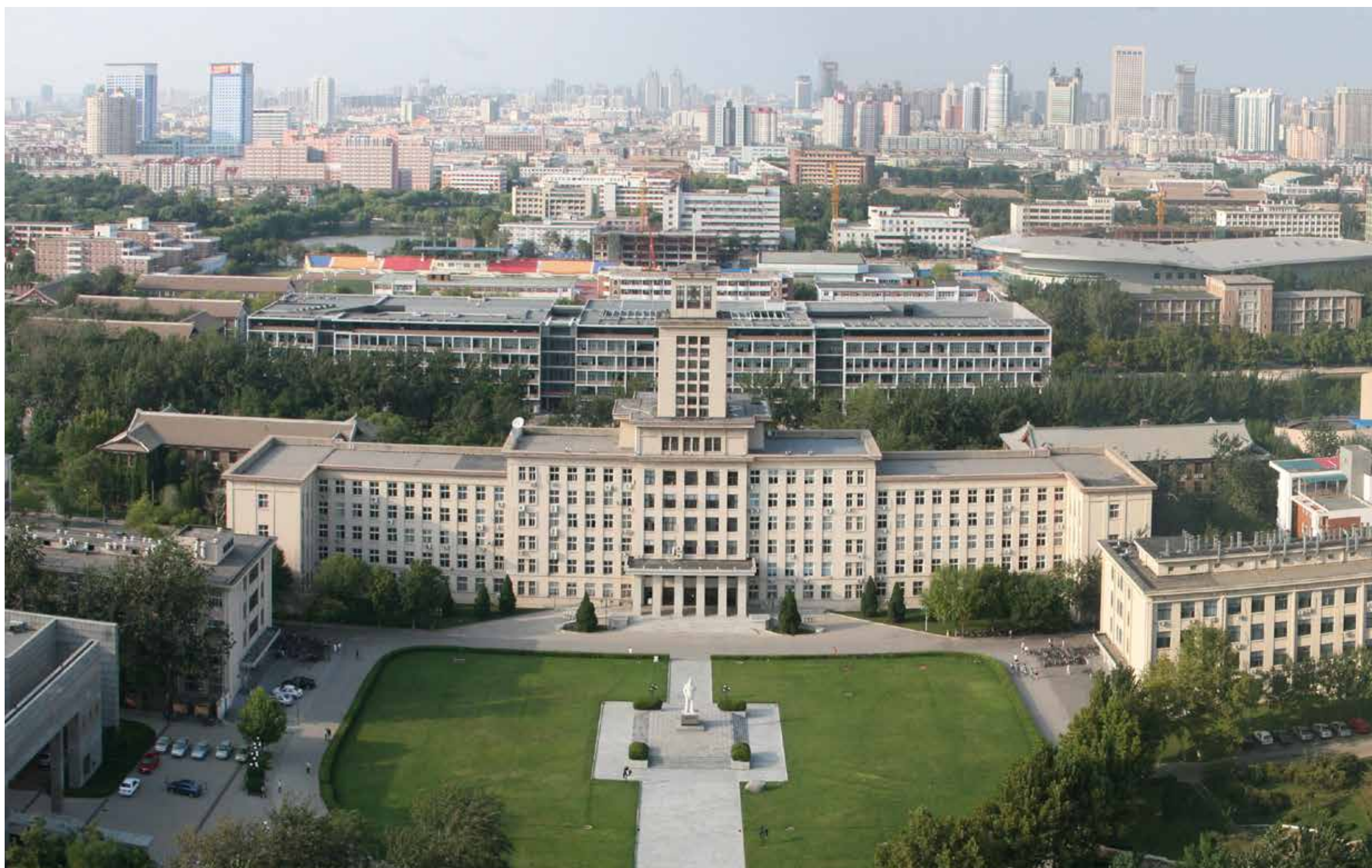
Ba Li Tai campus of Nankai University.