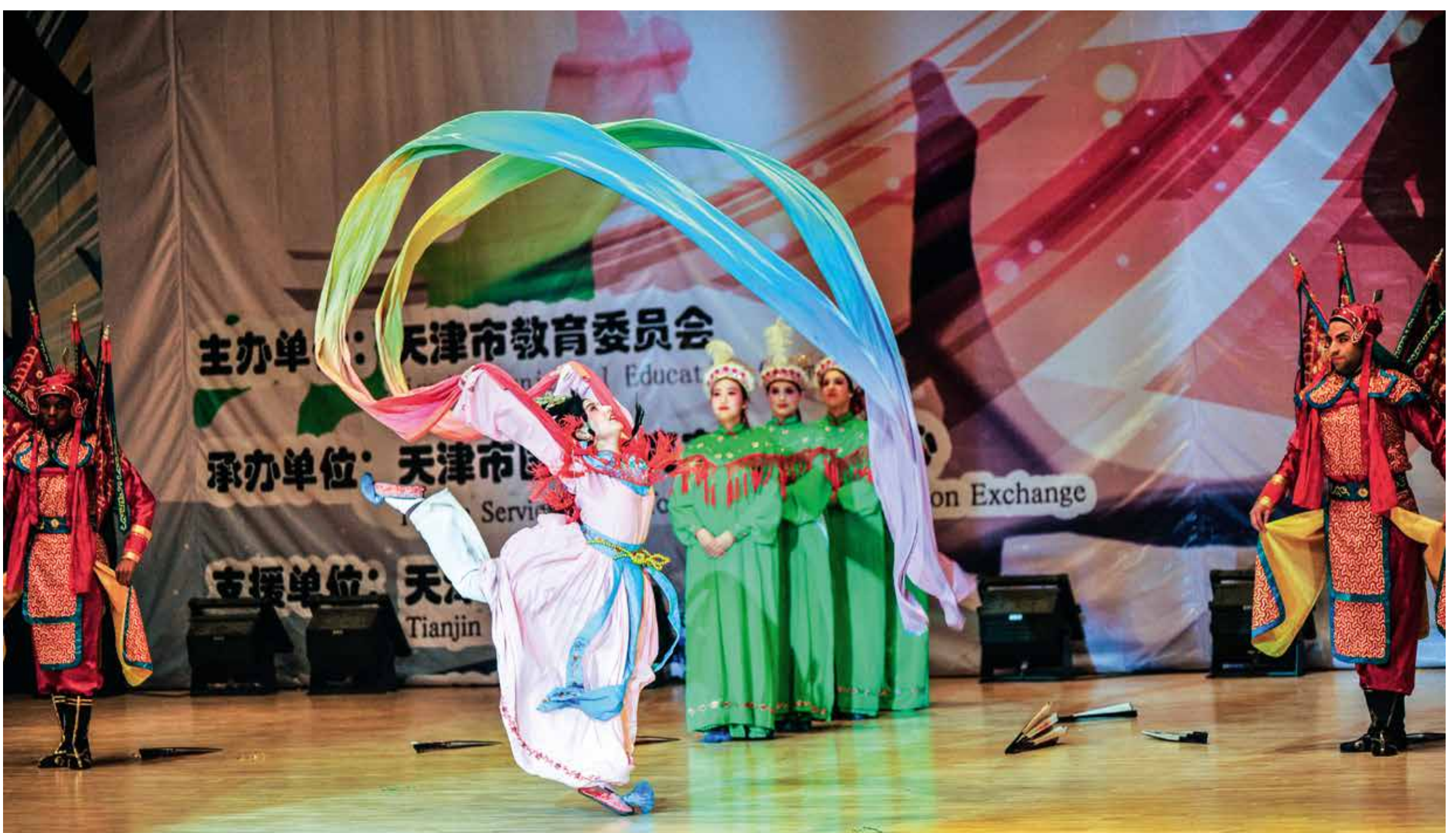
Student performance activities take place annually.

Career opportunities include positions in international organisations, government ministries, academia and research institutions, non-governmental organisations, and further study at PhD level.